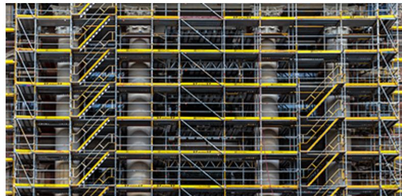
The best contributor during the period was Spanish commercial operator Inmobiliaria Colonial.

At the same time as entering this position, we sold out of German office operator DIC Real Estate at very good levels. During the quarter, we also exited the Austrian residential operator Buwog after a bid from German residential operator Vonovia.