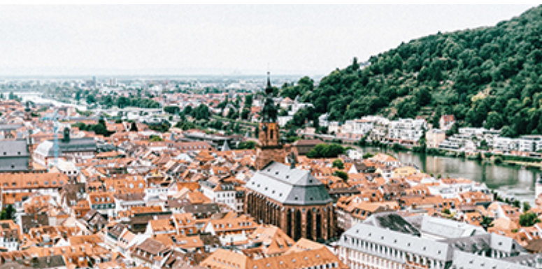
SKAGEN m2 added a new position, German Aroundtown, which is the largest listed German commercial operator.

The largest detractor in the quarter was Argentinian IRSA after strong performance last year. This was despite a report in line with expectations, some positive news about land plot acquisition and a share buyback program from its parent company. Despite a decent report, the Norwegian retail operator Olav Thon was a poor performer in the quarter due to general pressure on the Norwegian real estate sector and retail segment.